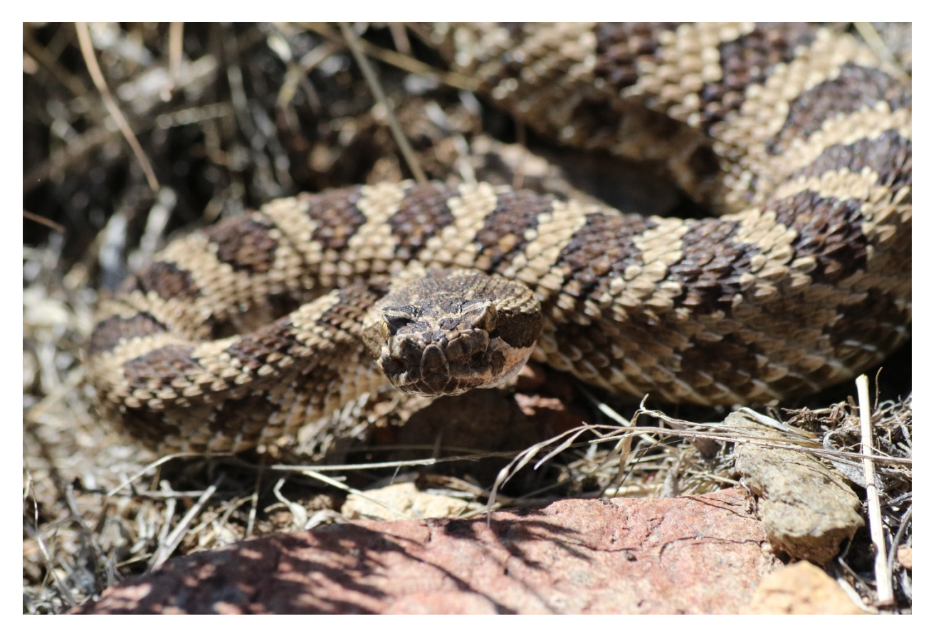
Rescued rattler release ( Crotalus oreganus lutosus ). Peavine Mountain foothills, NV 2020